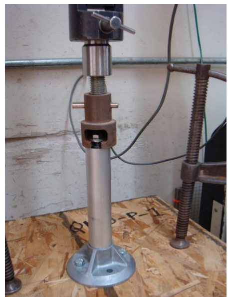
Figure 2b. Tensile Test Close-up