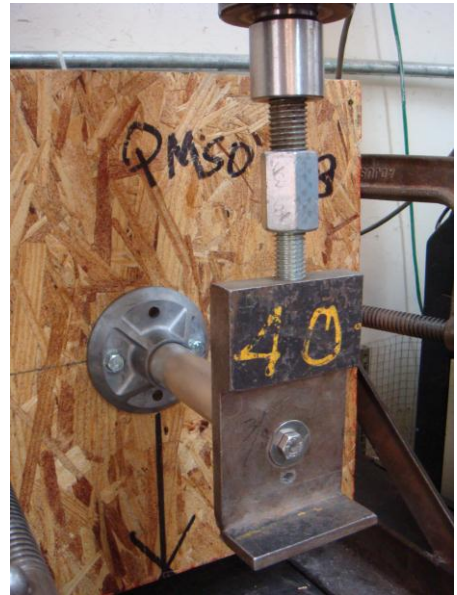
Figure 1b. Shear Test Close-up