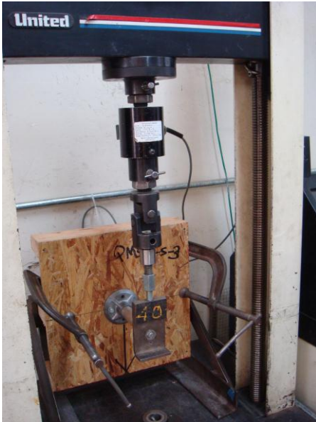
Figure 1a. Shear Test