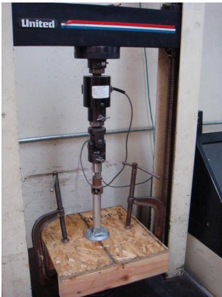
Figure 2a. Tensile Test